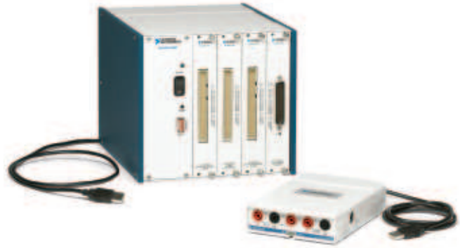
Figure 3. Use the USB-4065 with USB-controlled switching for a complete DMM/switch solution.