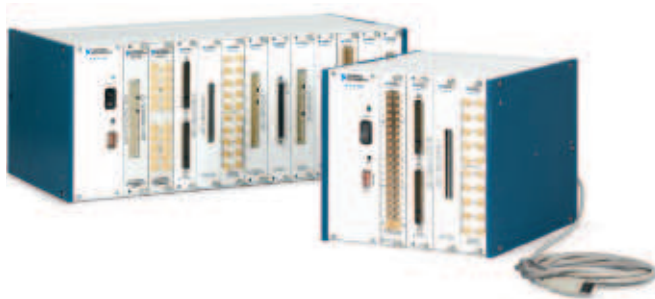
Figure 2. Expand channel count with USB-controlled switching.

You can integrate NI 4065 DMMs with stand-alone switching using the 4- or 12-slot USB Switch Mainframes from National Instruments. You can configure these switch systems, controllable from any available USB port on a PC or laptop computer, with more than 50 available SCXI switch topologies. For existing SCXI switch systems, the NI 4065 DMMs can also provide control via the AUX connector on the front of the DMM. Switching offers a simple method of channel expansion for data-logging systems based on an NI 4065.